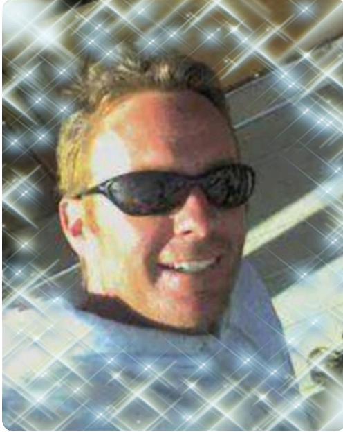
<3 love and miss you!